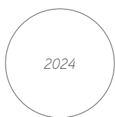
Hawaiian bottail squid