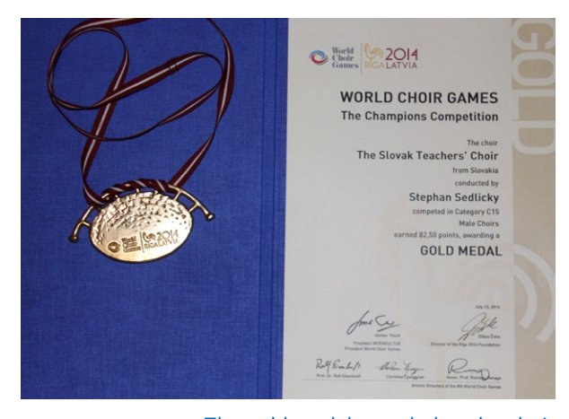
The gold medal awarded to the choir at the 8th World Choir Games in Riga in 2014