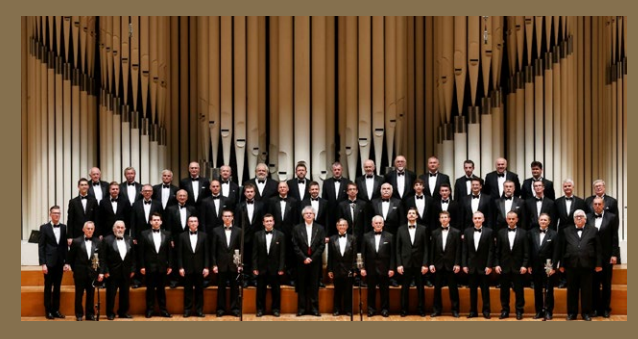
The choir performing its 95th anniversary concert at the Slovak Radio building

The central image is based on the logo of the Slovak Teachers' Choir, showing the head of a woman with long flowing hair in left profile. The upper part of the design depicts horizontal parallel lines overlaid with the Slovak coat of arms and, below it, the name of the issuing country 'SLOVENSKO'. In the middle of the lower part is a silhouette relief view of Trenčín, positioned above the coin's denomination and currency '10 EURO' and below the year of issuance '2021'. Between that date and the silhouette image are the mint mark of the Kremnica Mint (Mincovňa Kremnica), consisting of the letters 'MK' placed between two dies, and the stylised letters 'ZF' referring to the coin's designer Zbyněk Fojtů.