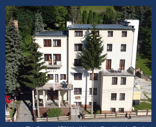
The Domov SZSU building in Trenčianske Teplice

The Slovak Teachers' Choir (Spevácky zbor slovenských učiteľov - SZSU) was established in the town of Trenčín on 3 March 1921, its founding motto being "To inspire love for the nation through singing" ("Spevom budiť lásku k rodu "). Its emergence stemmed from efforts to deepen fraternal relations between Slovaks, Czechs, and Slavs in general and to edify the Slovak nation. For one hundred years, the choir has existed as a Slovak-wide amateur male singing ensemble. While its membership is composed mainly of teachers, it also includes people from other occupations. A permanent home for the choir - Domov SZSU - was established in Trenčianske Teplice in 1933, paid for partly by contributions from teachers. In 1961 the choir "handed over" its property to the Revolutionary Trade Union Movement (Revolučné odborové hnutie). Since 1968 Domov SZSU has been administered by the state, at present through the Ministry of Education, Science,