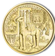
The Gold of the Incas