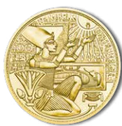
The Gold of the Pharaohs