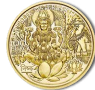
The Gold of India