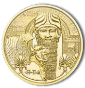
The Gold of Mesopotamia