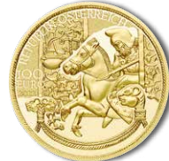
The Gold of the Scythians